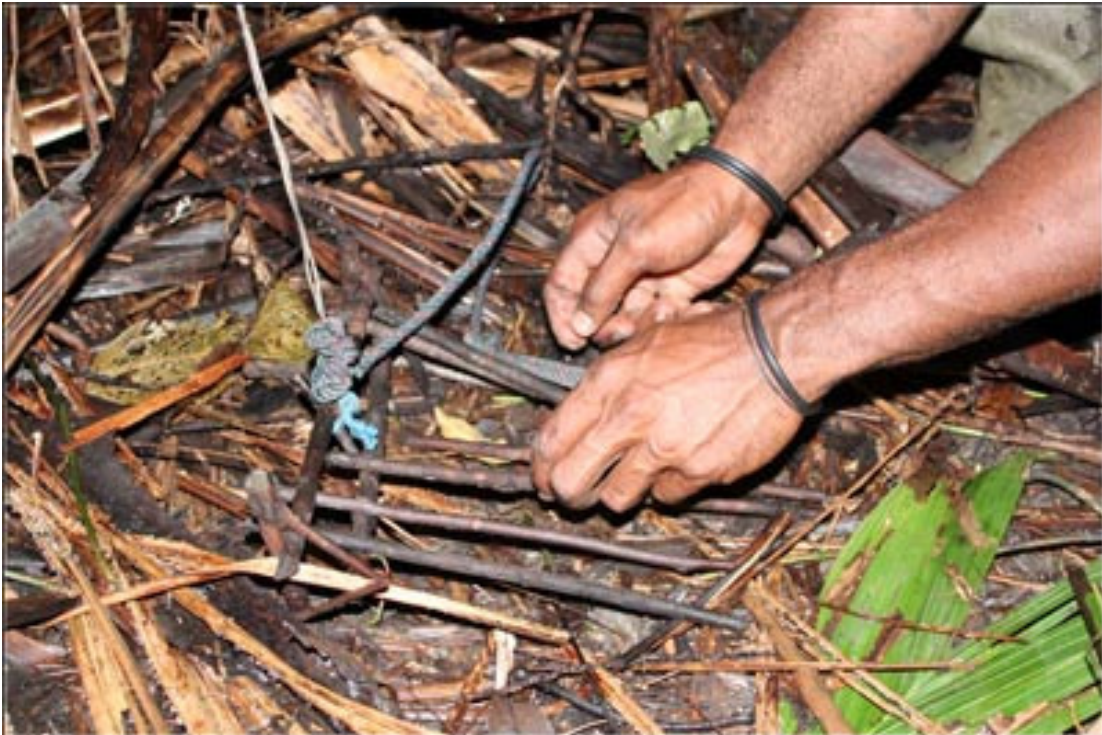
The trap-device looks simple, but is known to trap 20kg pigs.