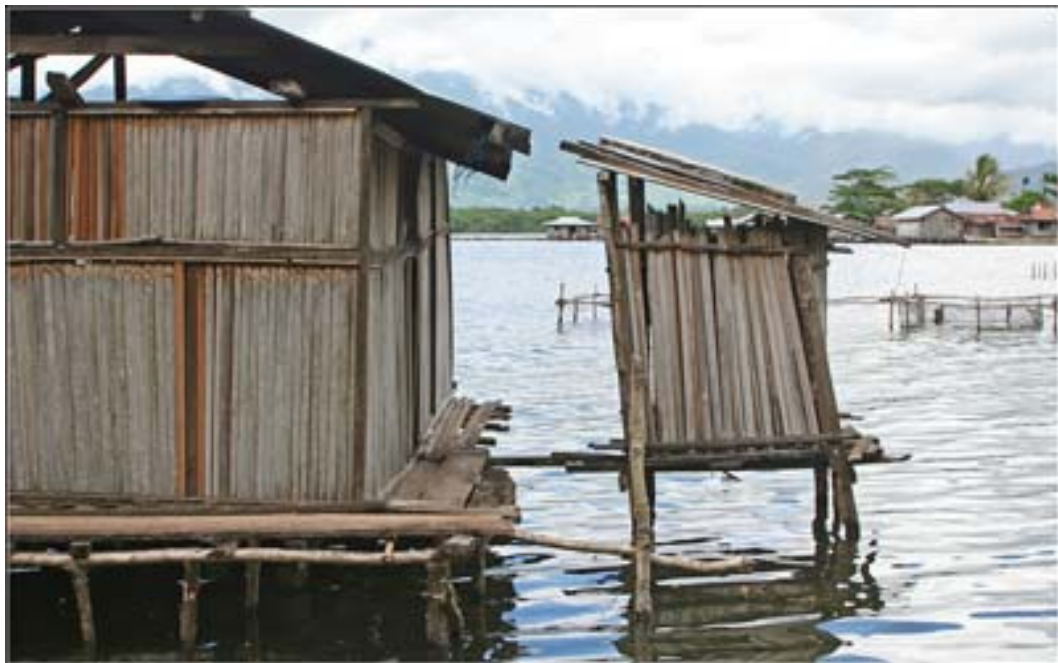
Toilets in Babrongko are often built as separate buildings.