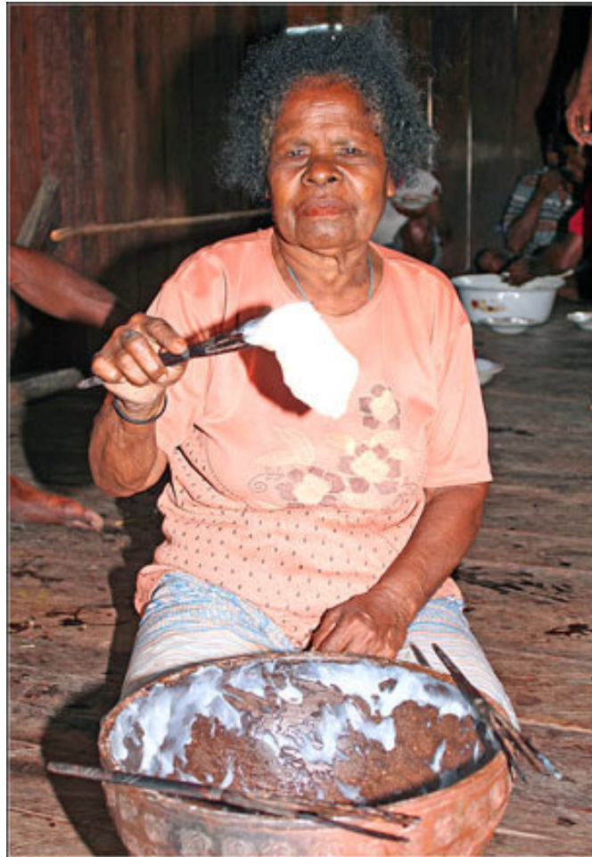
Papeda is the main product of Sago Flour.