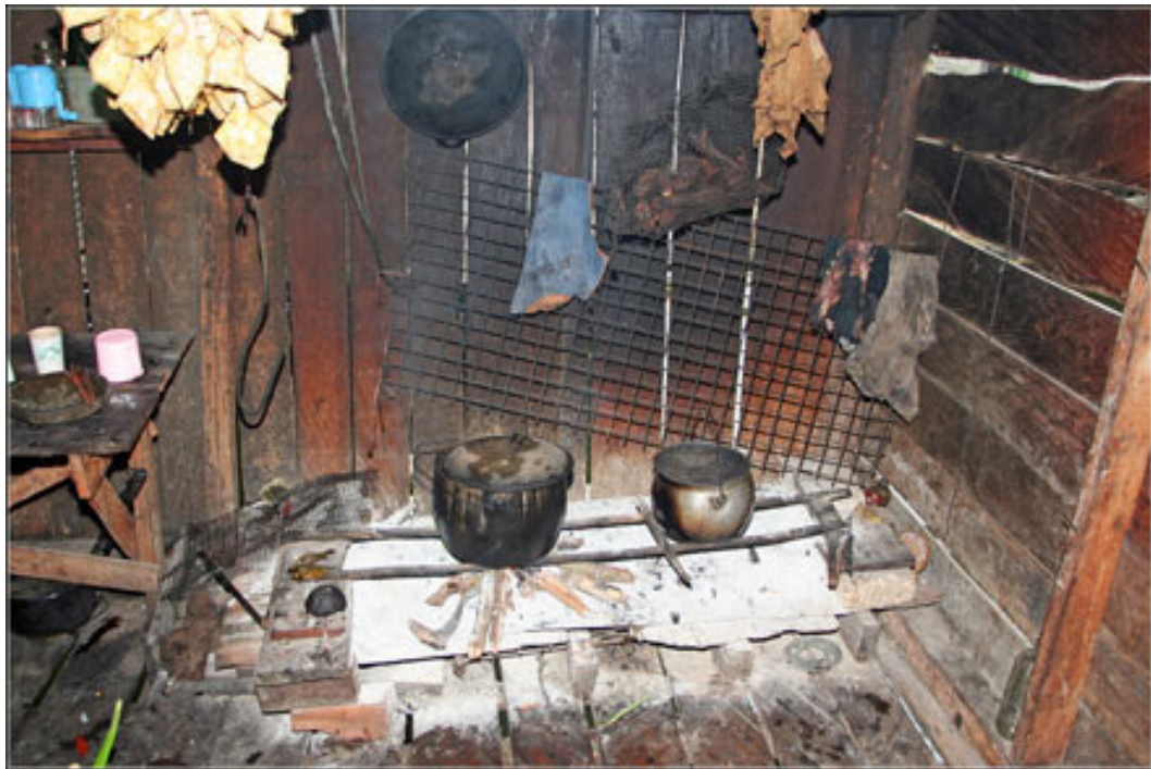
In the kitchen, firewood is still used as fuel for the flame.