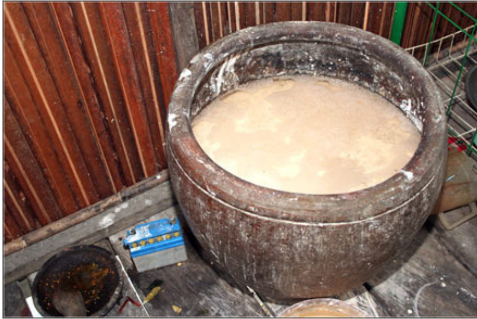
Sago starch is the main carbohydrate staple of the Sentani People.