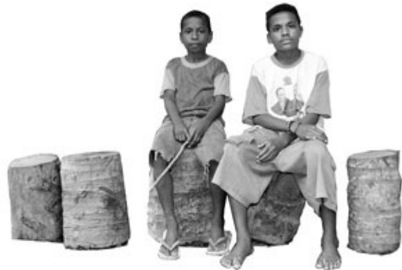
Trunk of coconut palm used as stools.

The trunk is simply cut in the preferred size and the “stool” is then usable. These stools can be made to be used in for example gardens.