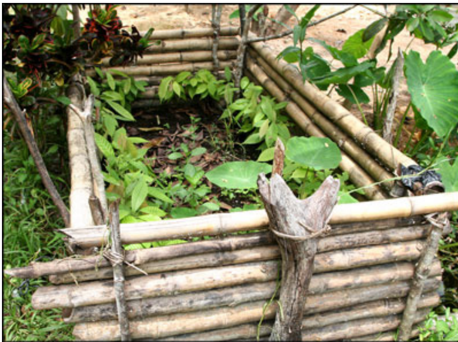
Fences are built to protect against scavengers, like the domesticated pig.

These can be built around plants, small trees and small gardens to prevent pigs and other animals in destroying them.