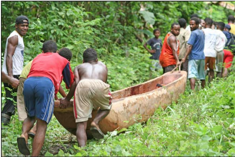
A newly built canoe is dragged trough the forest.