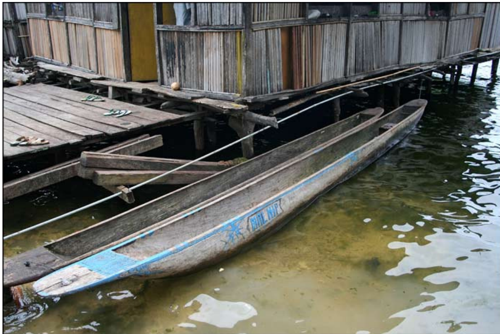
The larger and daily used Female-canoe.