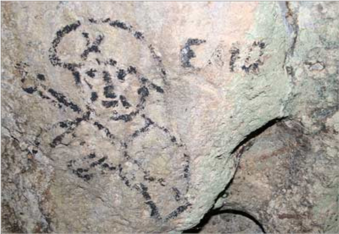
Painting in a cave near Baberongko. The painting resembles a soldier with a gun