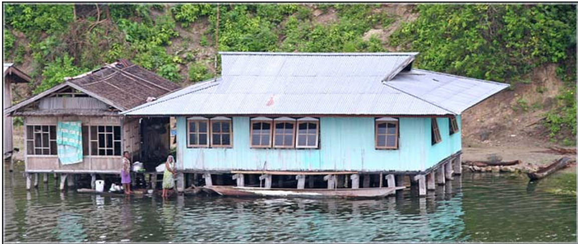
New trends. A more modern house at the shores of Lake Sentani.