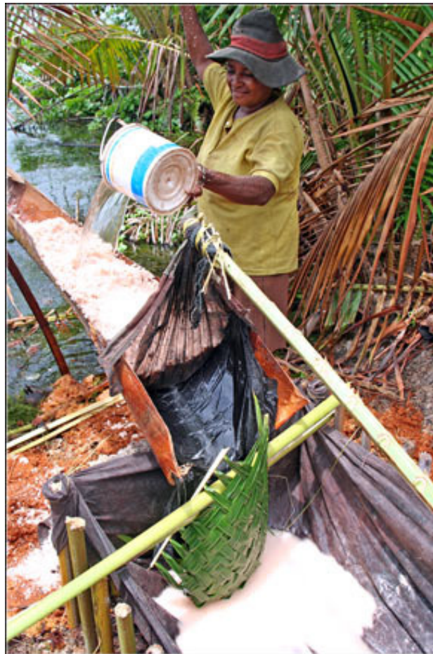
Sago grain is mixed with water and grinded.