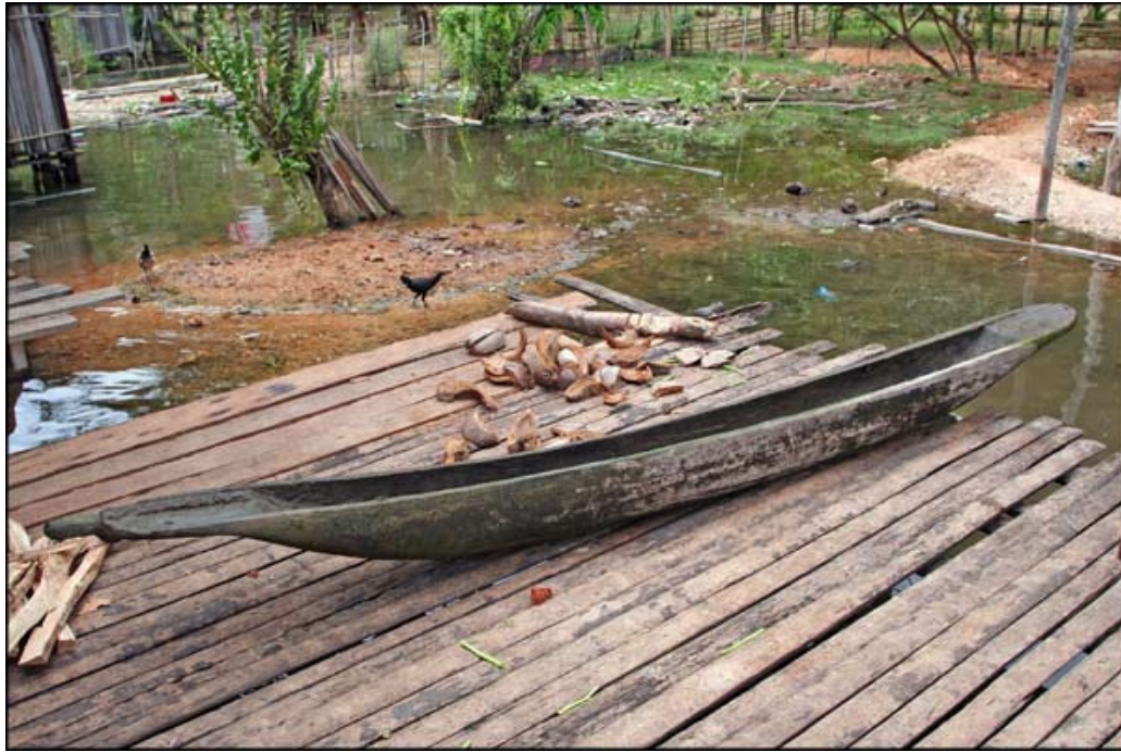
An aging male-canoe. At one time in history every man had his own, today only one functional remains in the village of Baberongko.