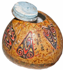
Lime Container made from coconut shell

The shell will now usually be decorated with carvings or even paintings.