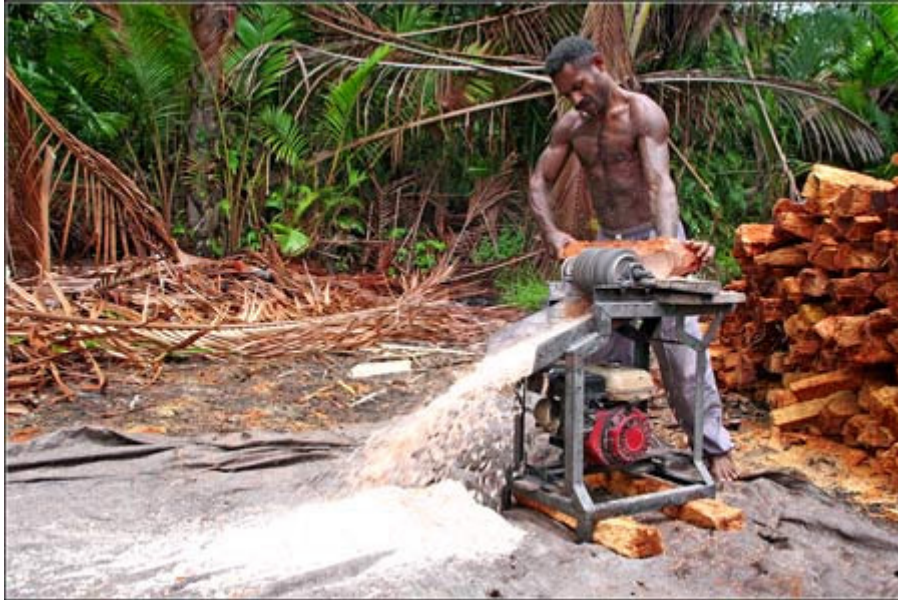
Pieces of the sago palm bole are grained.