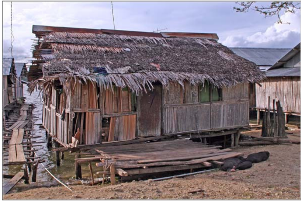
A traditional Lake Sentani house.