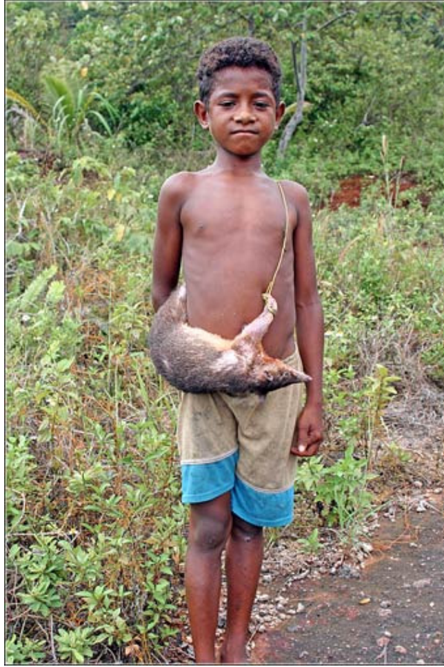
A proud boy and his catch, a forest-rat caught in a trap.