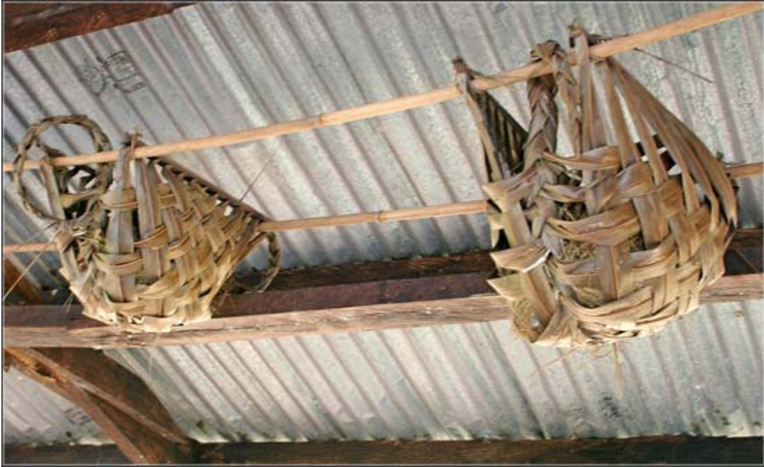
Nests for the hens are placed under the roof.